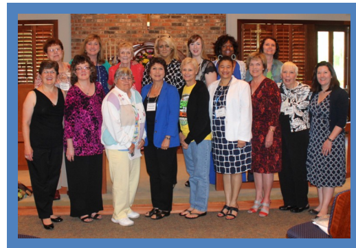
Members of St. Mark's Order of the Daughters of the King are dedicated to a life of prayer, service to those in need, and to evangelism.